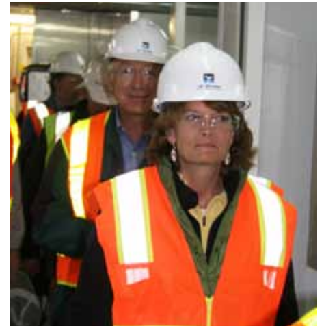
Senator Lisa Murkowski and Secretary of the Interior Ken Salazar touring the Barrow Replacement Hospital project site

of construction for the replacement hospital. The hospital will improve the medical services available to our community and it will also create many valuable local jobs for our shareholders and their descendants. We are working very closely with the Arctic Slope Native Association (ASNA) and Indian Health Service to make sure we are prepared when the hospital comes online, including seeking the support of the Alaska delegation for funding of a complete staffing package. In August, we were honored to be able to help ASNA host Senator Lisa Murkowski; Chairman of the Interior Appropriations Subcommittee, Senator Jack Reed (D-RI); Secretary of the Interior, Ken Salazar; and Department of Health and Human Services Secretary, Kathleen Sebelius on their visits to Barrow. They all expressed their appreciation for the tour of the Barrow Replacement Hospital project site and of the briefing on the expanded medical services the new facility will provide to Barrow and its surrounding communities.